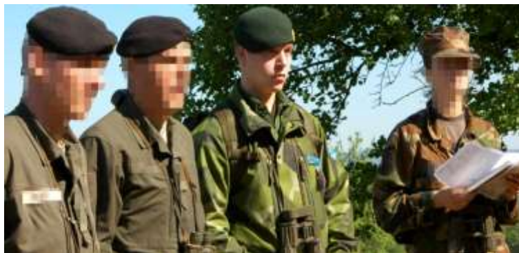
Figure 1: National and international Officer Cadets during the leadership training Crisis Management Operations. 5

Basically pictures, graphs or tables are to use for supporting the thesis text. As literal citations they are to be commentated before and/or after.